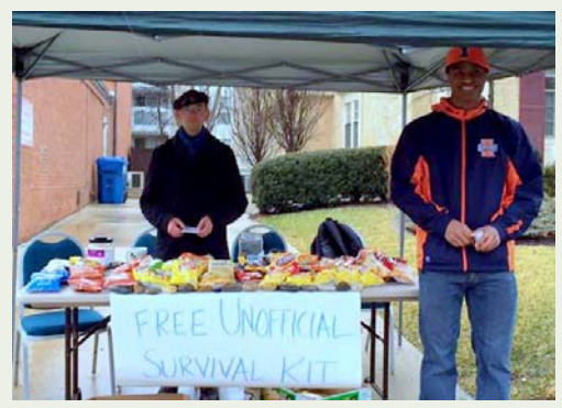
On this campus, known for excessive drinking, St. Andrew's students handed out 300 leaflets they designed about alcohol awareness with a list of crisis lines.