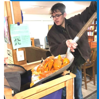
From top left clockwise: volunteering with Books to Prisoners, digging into Scripture in our Lenten Bible Study, composting pumpkins after Halloween, raising funds and awareness for the hungry in the CROP Walk, installing a succulent garden at church, and