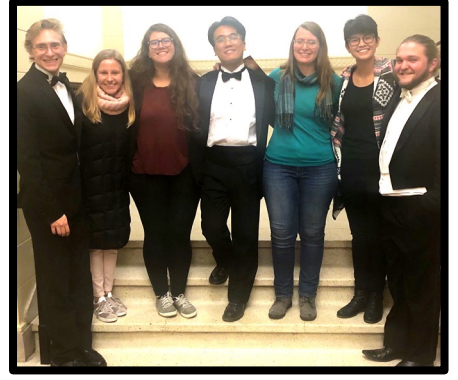
(L) Supporting each other by attending one anothers' concerts and events. (R) One of many Zoom worship, Bible study, and fellowship gatherings. Where two or more are zooming in Christ's name, there he is among them.