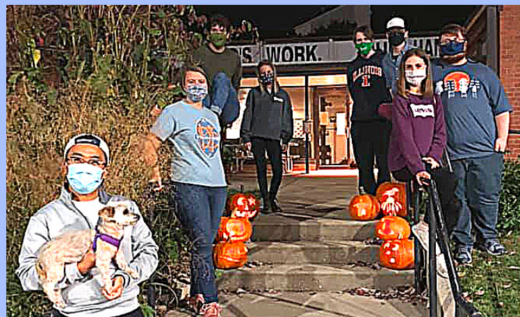
Pandemic did not cancel our Halloween pumpkin carving!