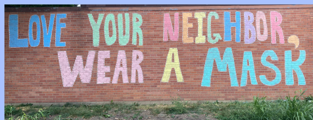
Our Student Ministers sent a strong message to campus in the fall!