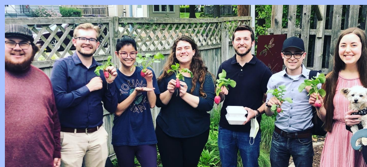
An impulsive springtime, vaccination era picnic after worship, garden fresh radishes included!

Jesus said that the greatest commandment is to love God above all else and to love your neighbor as yourself, and I believe it is the church's mission to help people understand this and do this. As a member of the St. A's Council for the year ahead, I look forward to finding ways to serve our neighbors better.